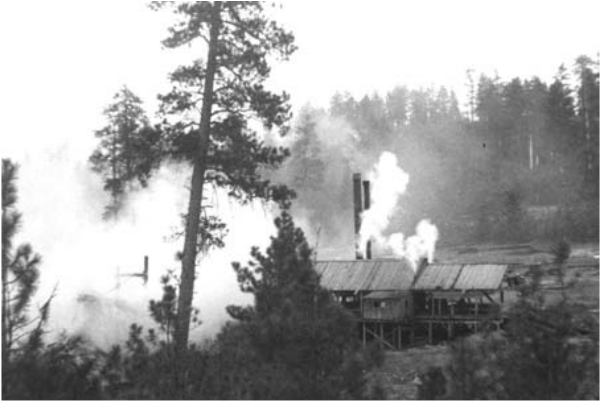
Camp Watson sawmill's west side, looking east.