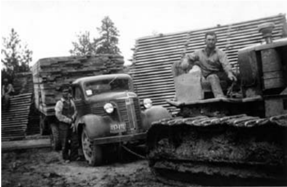
Men not identified. This is the Hudspeth Sawmill Company's lumber drying yard. The Cat is pulling the truck. The lumber yard was bare earth so when it was wet it was also muddy. When mud wasn't the problem, dust was.