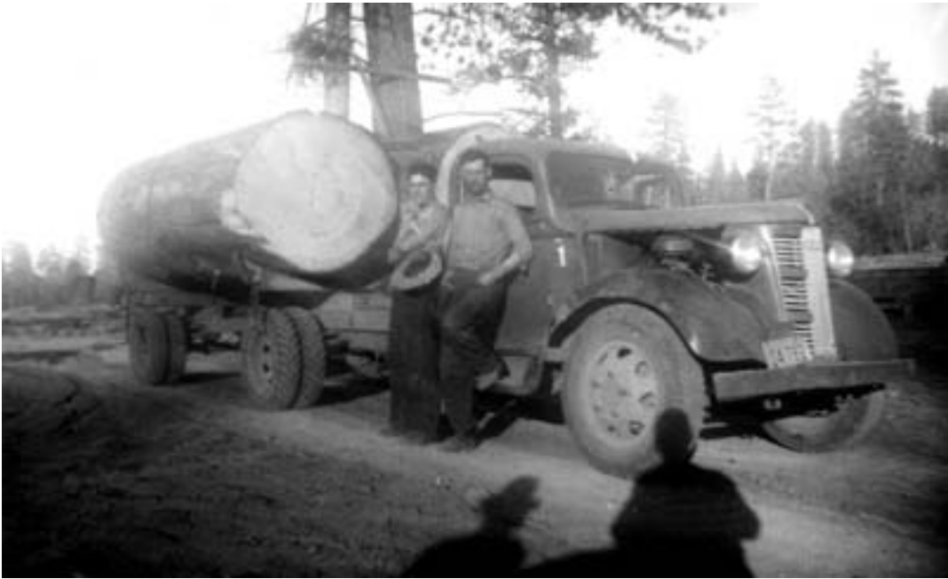
Claud Binam & Tommy O'Dell. Two logs to the load. Not always; sometimes one log was enough. The Hudspeths brought mules with them from Oklahoma. It was quickly learned that the mules couldn't pull logs like these. But in the beginning the large trees were bypassed for those of a size that the mules could pull to the mill.