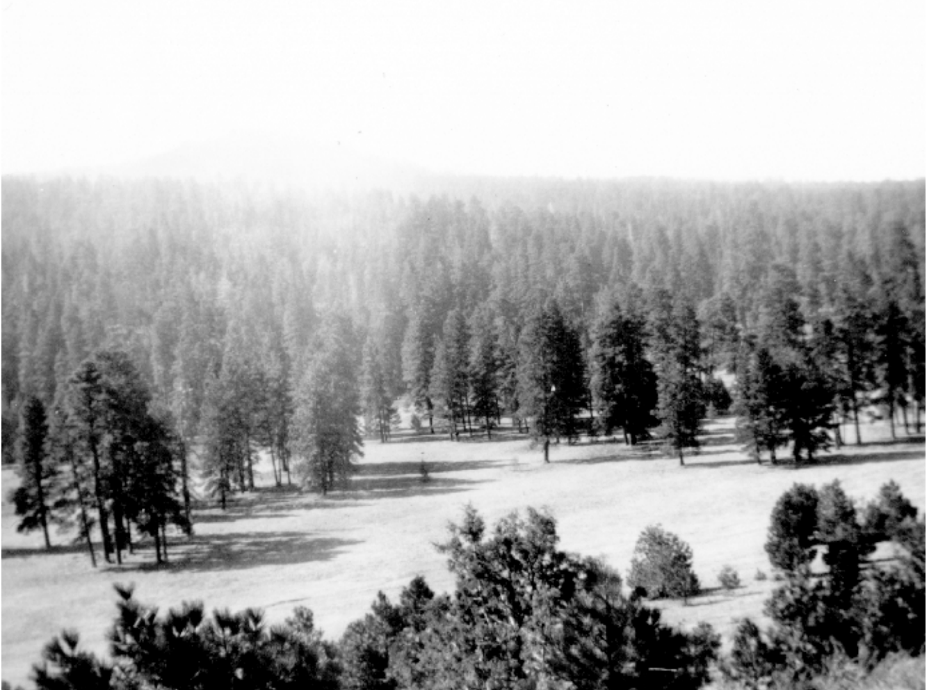
The meadow south of the fort as the new arrivals of Hudspeth Sawmill Company found it in 1936.