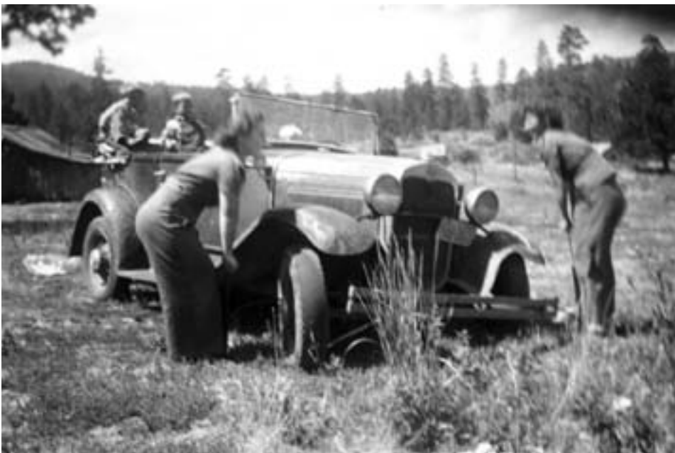
These two women haven't been identified. Sometimes you just had to get out of camp. Most of the groceries were bought in Prineville. Today that is a so-what trip but in the late 1930's, over a steep, crooked, gravel/dirt road it was a chore. These women don't look like their upset; they look like they are about to embark on some sort of lark.