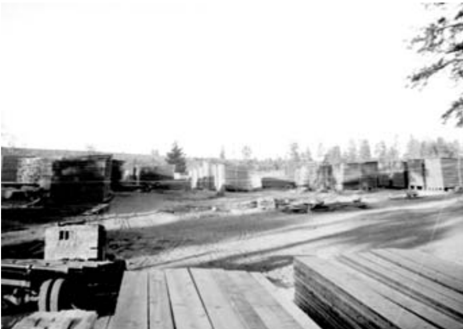
The drying yard. From the amount of lumber seen in this photograph one can assume that Hudspeth Sawmill Company was a busy place.